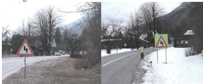
Picture 2. Displaying dangerous place before and after the implementation of measures of class I

This class of measures are undertaken at those locations where they are not needed construction works, and where are already adequate road signs (better class to create traffic signs, new traffic signs, maintenance ...) sufficient to achieve a higher level of safety in road traffic. Examples of such repairs are shown in Table 1 under regular maintenance program (Karlovac D3, Čibaća, Velika Mučna...), which includes the maintenance or replacement of existing traffic signs. Picture 2 gives an example of taking measures for the rehabilitation of a first-class dangerous place where the existing signs are replaced and supplemented with new traffic signs and road markings.