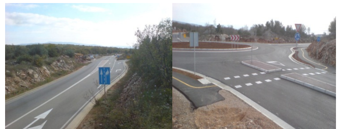
Picture 3. Displaying dangerous place before and after the implementation of measures of class I

In Croatia, this type of measures is usually implemented through programs Betterment and national road safety program (Table 1). The national program of road safety of Croatian basic document and a platform to raise the level of road safety in our country to a higher, more acceptable level than current, while the Betterment Program (a program of increased maintenance and project specific rehabilitation) is the rehabilitation of the road network, and is funded partly of loan funds from the European Investment Bank, and partly from its own resources Croatian Roads Ltd. Picture 3 gives examples of taking action of II. Class measures that include building technical measures and traffic-technical characteristics (Betterment Program).