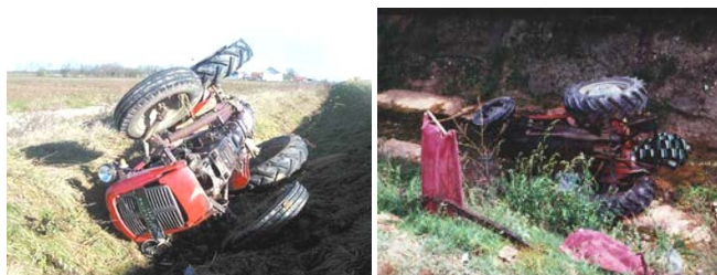
Fig. 2. Overturning of a tractor with tragic consequences

The average age of the tractors in the Republic of Macedonia is 26 years [24], and the older amortized tractors (often with a faulty system for steering and braking, faulty warning lights, etc..) do not have built-in safety cab or frame, and no other security electronic devices which control the position and tractor work. In such a situation, serious injuries and even fatalities, injury to the operator or passenger of the tractor (which are driven mostly on the bumper or stand in the rear of the tractor without the possibility of protection) are inevitable.