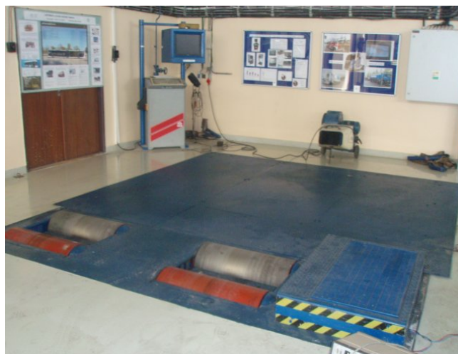
Fig. 1 Rollingstand in the laboratory.

The rollingstand, other equipment, the vehicle and laboratory are the property of the Department of the Road and Urban Transport at the University of Zilina.